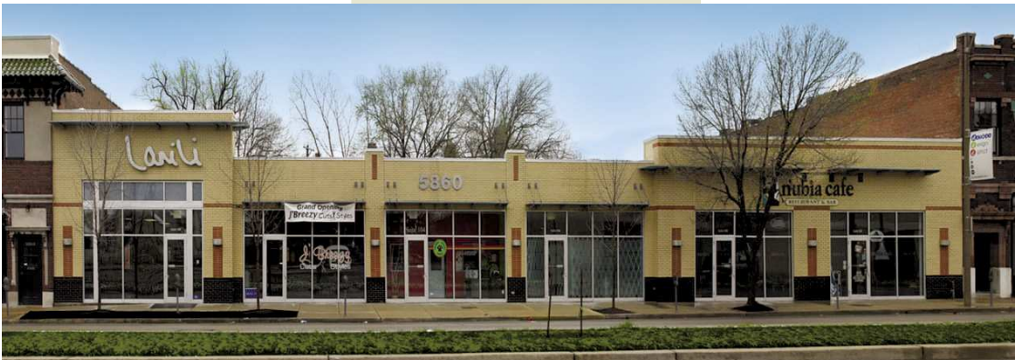
view from street