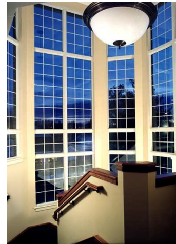
stair tower, second floor