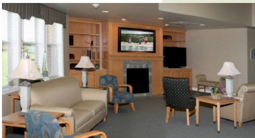
fire side lounge