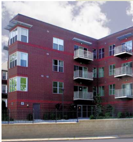
view from street