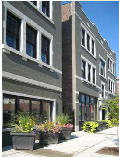
view from Olive Boulevard