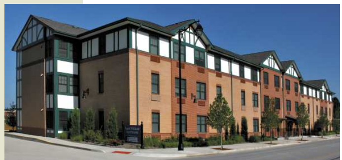
southeast view from street